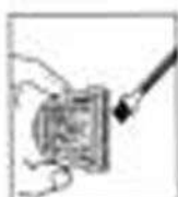
2 Blade can be dismantled for cleaning