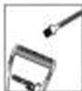
1 Clean blade with cleaning brush