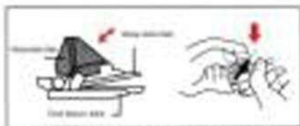
3 When using trimmer head adjust up to increase the air for spray cutting and fuel tank